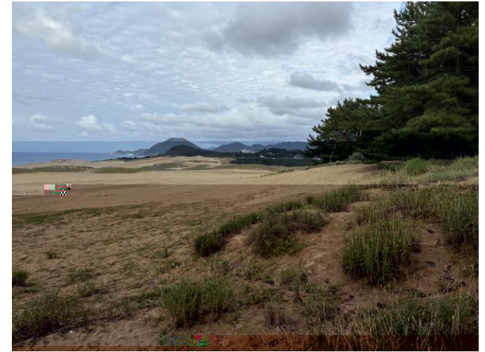
Tottori Sand Dune

A Model for a Sustainable Future: Its compact size makes it an ideal testing ground for social innovation.